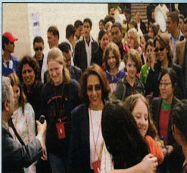
Chicago teens meet Moroccan teens.